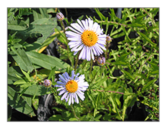
Spring Blue Aster flowers