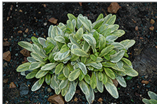
Toffee Chip Bugleweed