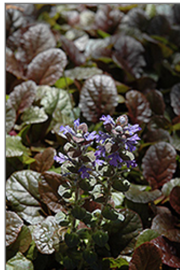
Purple Brocade Bugleweed flowers

Purple Brocade Bugleweed is recommended for the following landscape applications;