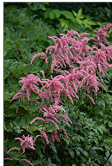
Super Sprite Astilbe flowers