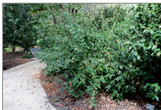
Tea Plant in bloom