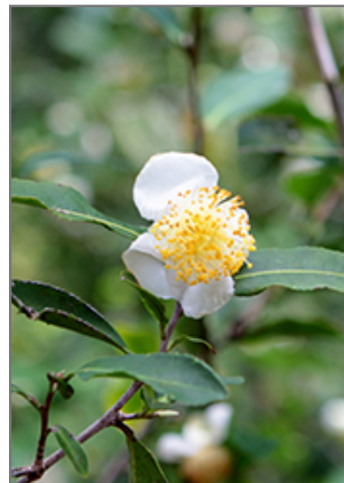
Tea Plant flowers

This is a multi-stemmed evergreen woody herb with an upright spreading habit of growth. Its average texture blends into the landscape, but can be balanced by one or two finer or coarser trees or shrubs for an effective composition. This is a relatively low maintenance plant, and should only be pruned after flowering to avoid removing any of the current season's flowers. It has no significant negative characteristics.