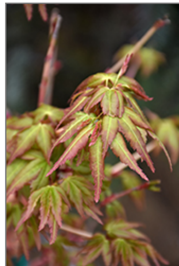
Bihou Japanese Maple foliage