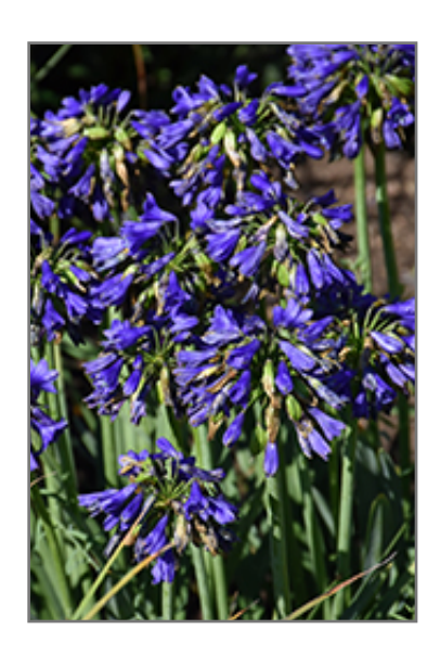
Every Midnight Agapanthus flowers

When grown indoors, Every Midnight Agapanthus can be expected to grow to be about 12 inches tall at maturity extending to 18 inches tall with the flowers, with a spread of 18 inches. It grows at a medium rate, and under ideal conditions can be expected to live for approximately 10 years. This houseplant will do well in a location that gets either direct or indirect sunlight, although it will usually require a more brightly-lit environment than what artificial indoor lighting alone can provide. It prefers to grow in average to moist soil. The surface of the soil shouldn't be allowed to dry out completely, and so you should expect to water this plant once and possibly even twice each week. Be aware that your particular watering schedule may vary depending on its location in the room, the pot size, plant size and other conditions; if in doubt, ask one of our experts in the store for advice. It will benefit from a regular feeding with a general-purpose fertilizer with every second or third watering. It is not particular as to soil type or pH; an average potting soil should work just fine.