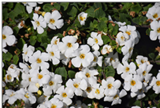
MegaCopa White Bacopa flowers