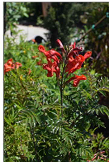
Riot Red Cape Honeysuckle flowers