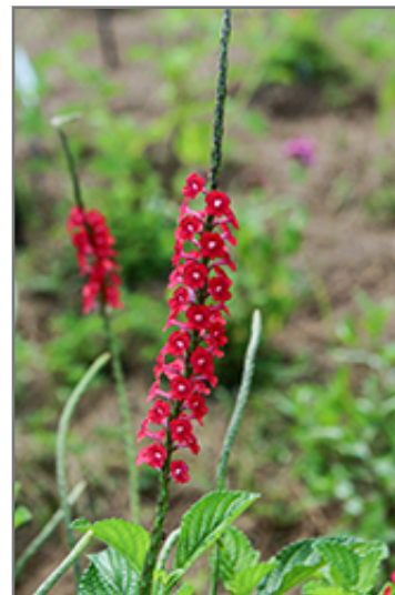
Dwarf Red Porterweed flowers

Dwarf Red Porterweed is recommended for the following landscape applications;