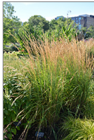
Waldenbuch Reed Grass