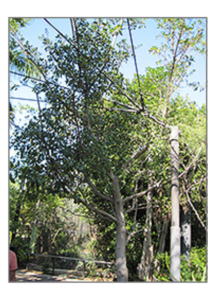
Forest Strangler Fig

Forest Strangler Fig has attractive dark green foliage with grayish green undersides on a tree with an upright spreading habit of growth. The small glossy oval sprays of foliage are highly ornamental but do not develop any appreciable fall color. The fruits are showy yellow pomes with a scarlet blush, which are carried in abundance from early summer to late fall. The fruit can be messy if allowed to drop on the lawn or walkways, and may require occasional clean-up. The smooth gray bark is extremely showy and adds significant winter interest.