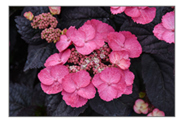
Pink Dynamo Hydrangea flowers

Pink Dynamo Hydrangea is a multi-stemmed deciduous shrub with a more or less rounded form. Its relatively coarse texture can be used to stand it apart from other landscape plants with finer foliage.