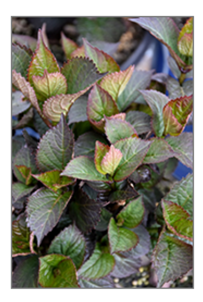
Pink Dynamo Hydrangea foliage

This is a relatively low maintenance shrub, and should only be pruned after flowering to avoid removing any of the current season's flowers. It has no significant negative characteristics.