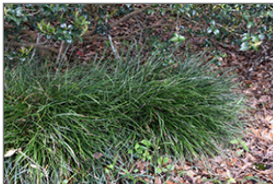
Seoulitary Man Mondo Grass