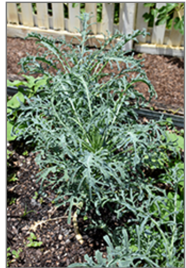
Jagallo Nero Kale flowers

This plant is typically grown in a designated vegetable garden. It does best in full sun to partial shade. It requires an evenly moist well-drained soil for optimal growth, but will die in standing water. It may require supplemental watering during periods of drought or extended heat. This plant is a heavy feeder that requires frequent fertilizing throughout the growing season to perform at its best. It is not particular as to soil pH, but grows best in rich soils. It is somewhat tolerant of urban pollution. Consider applying a thick mulch around the root zone over the growing season to conserve soil moisture. This is a selected variety of a species not originally from North America.