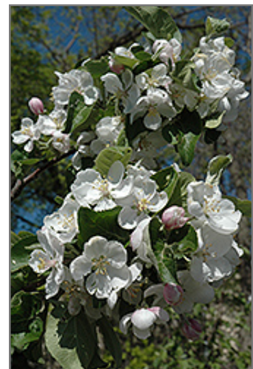
Red Sparkle Apple flowers