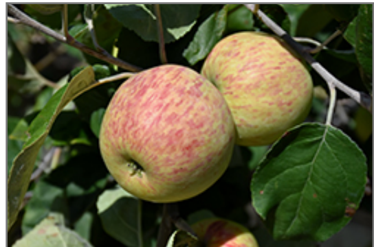
Red Sparkle Apple fruit

Red Sparkle Apple features showy clusters of lightly-scented white flowers with shell pink overtones along the branches in mid spring, which emerge from distinctive pink flower buds. It has forest green deciduous foliage. The pointy leaves turn yellow in fall. The fruits are showy light green apples with a scarlet blush, which are carried in abundance from late summer to early fall. The fruit can be messy if allowed to drop on the lawn or walkways, and may require occasional clean-up.