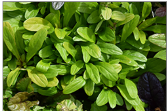
Feathered Friends Cordial Canary Bugleweed foliage