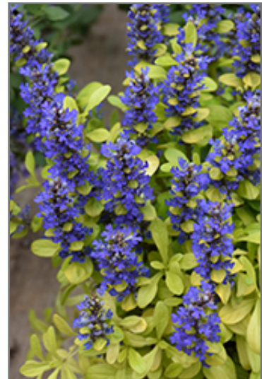
Feathered Friends Cordial Canary Bugleweed flowers