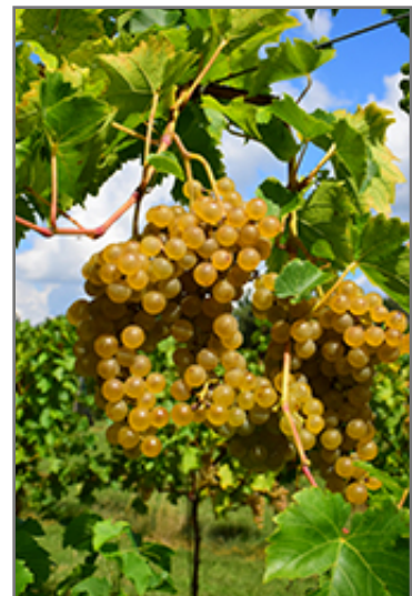
Seyval Blanc Grape fruit