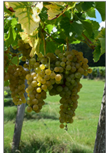
Seyval Blanc Grape fruit

Seyval Blanc Grape has rich green deciduous foliage on a plant with a spreading habit of growth. The lobed leaves turn yellow in fall. It produces abundant clusters of light green grapes with gold overtones in mid fall.