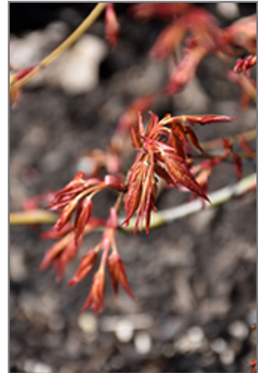
Orange Marmalade Japanese Maple foliage