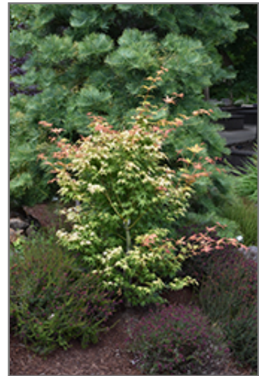
Orange Marmalade Japanese Maple