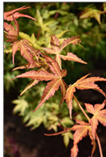
Orange Marmalade Japanese Maple foliage

Orange Marmalade Japanese Maple is a fine choice for the yard, but it is also a good selection for planting in outdoor pots and containers. Its large size and upright habit of growth lend it for use as a solitary accent, or in a composition surrounded by smaller plants around the base and those that spill over the edges. It is even sizeable enough that it can be grown alone in a suitable container. Note that when grown in a container, it may not perform exactly as indicated on the tag - this is to be expected. Also note that when growing plants in outdoor containers and baskets, they may require more frequent waterings than they would in the yard or garden.