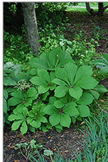
Fingerleaf Rodgersia foliage

This attractive shade-loving groundcover is grown both for its large palm-like leaves that emerge a deep chocolate color, as well as the plumes of airy white flowers that tower above; must have evenly moist soil