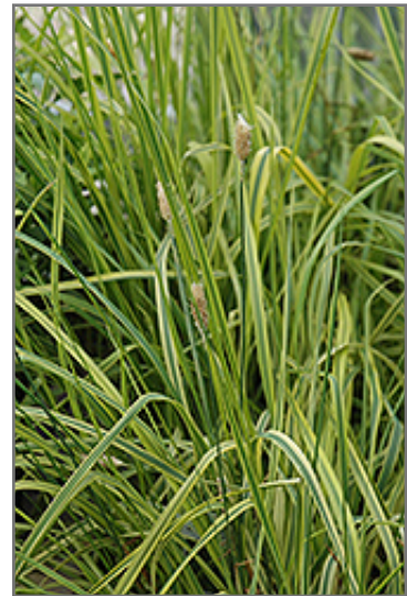
Variegated Foxtail Grass foliage