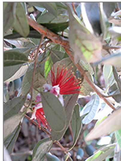
Trask Pineapple Guava flowers

Trask Pineapple Guava features showy white pincushion flowers with fuchsia overtones and scarlet anthers at the ends of the branches from late spring to early summer. It has dark green foliage with gray undersides. The fuzzy oval pinnately compound leaves remain dark green throughout the winter. The fruits are showy bluish-green drupes carried in abundance from early summer to mid fall.