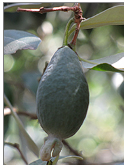
Trask Pineapple Guava fruit