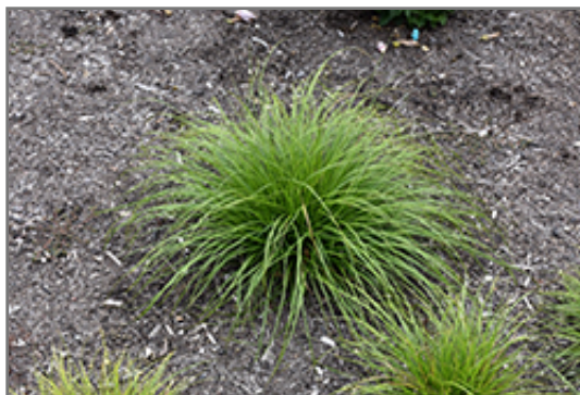
Pennsylvania Sedge