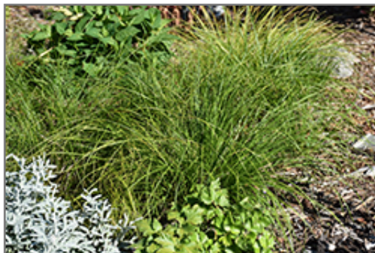
Pennsylvania Sedge