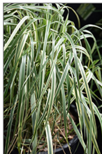
Hello Spring! Reed Grass foliage