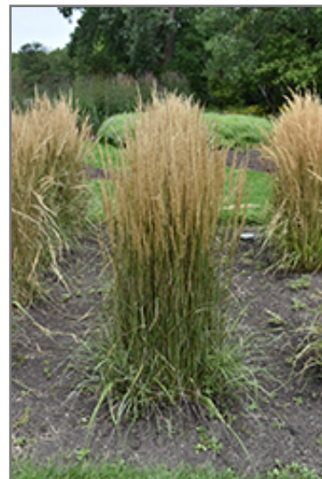
Hello Spring! Reed Grass in bloom

Hello Spring! Reed Grass is recommended for the following landscape applications;