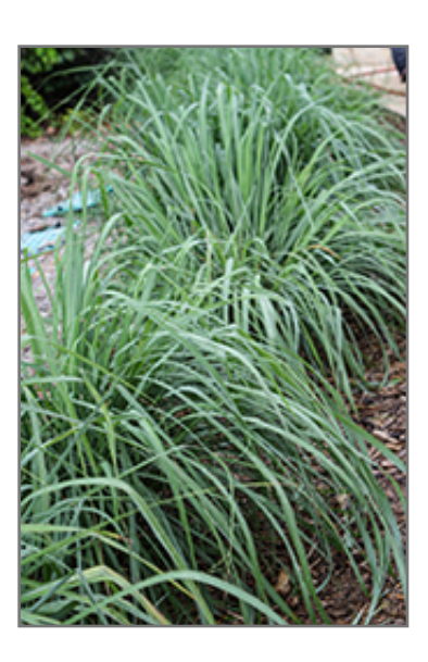
Lemon Grass