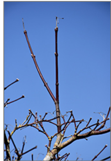
Burgundy Jewel Vine Maple bark

Burgundy Jewel Vine Maple will grow to be about 6 feet tall at maturity, with a spread of 4 feet. It has a low canopy, and is suitable for planting under power lines. It grows at a slow rate, and under ideal conditions can be expected to live for 60 years or more.