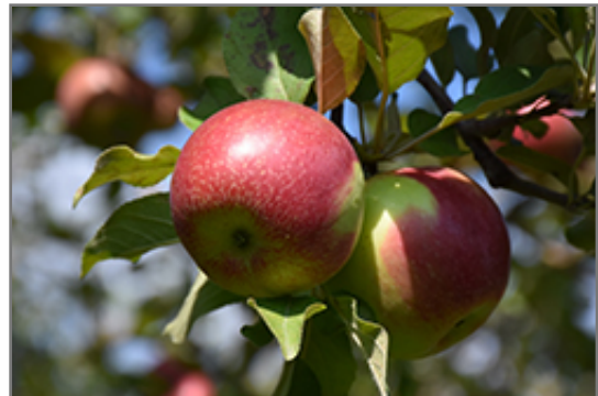
KinderKrisp Apple fruit

This is a deciduous tree with a more or less rounded form. Its average texture blends into the landscape, but can be balanced by one or two finer or coarser trees or shrubs for an effective composition. This is a high maintenance plant that will require regular care and upkeep, and is best pruned in late winter once the threat of extreme cold has passed. Gardeners should be aware of the following characteristic(s) that may warrant special consideration;