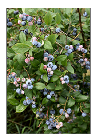
Rubel Blueberry fruit