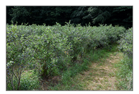
Rubel Blueberry fruit

Rubel Blueberry will grow to be about 8 feet tall at maturity, with a spread of 6 feet. It tends to be a little leggy, with a typical clearance of 1 foot from the ground, and is suitable for planting under power lines. It grows at a fast rate, and under ideal conditions can be expected to live for approximately 30 years. This variety requires a different selection of the same species growing nearby in order to set fruit.