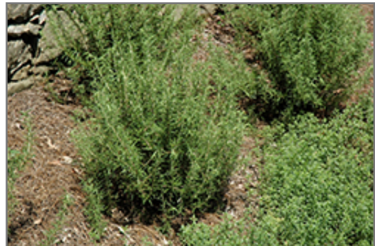
Salem Rosemary

Aside from its primary use as an edible, Salem Rosemary is suitable for the following landscape applications;