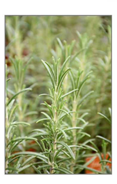
Ingauno Rosemary foliage

Aside from its primary use as an edible, Ingauno Rosemary is sutiable for the following landscape applications;