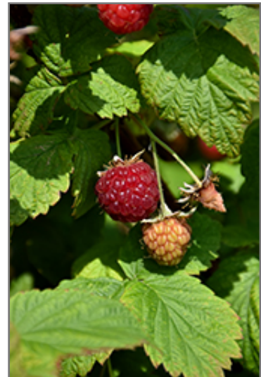
Festival Raspberry fruit

This is an open multi-stemmed deciduous shrub with an upright spreading habit of growth. Its relatively coarse texture can be used to stand it apart from other landscape plants with finer foliage. This is a high maintenance plant that will require regular care and upkeep. Each spring, cut back all dead and two-year old canes to the ground, leaving only last year's growth standing. It is a good choice for attracting birds to your yard. Gardeners should be aware of the following characteristic(s) that may warrant special consideration;