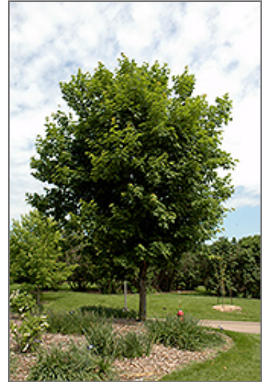
Sugar Maple

This tree should only be grown in full sunlight. It prefers to grow in average to moist conditions, and shouldn't be allowed to dry out. It may require supplemental watering during periods of drought or extended heat. It is not particular as to soil pH, but grows best in rich soils. It is somewhat tolerant of urban pollution. This species is native to parts of North America.