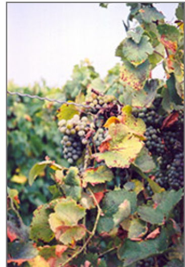
Gewurztraminer Grape fruit

Aside from its primary use as an edible, Gewurztraminer Grape is suitable for the following landscape applications;