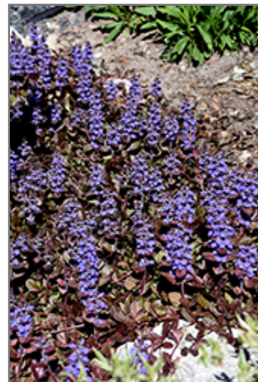
Mahogany Bugleweed flowers

This plant will require occasional maintenance and upkeep, and should not require much pruning, except when necessary, such as to remove dieback. It is a good choice for attracting butterflies to your yard, but is not particularly attractive to deer who tend to leave it alone in favor of tastier treats. Gardeners should be aware of the following characteristic(s) that may warrant special consideration;