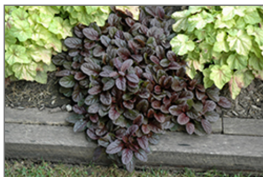
Mahogany Bugleweed