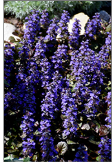
Mahogany Bugleweed flowers

This plant does best in partial shade to full shade. Keep it well away from hot, dry locations that receive direct afternoon sun or which get reflected sunlight, such as against the south side of a white wall. It does best in average to evenly moist conditions, but will not tolerate standing water. It may require supplemental watering during periods of drought or extended heat. It is not particular as to soil type or pH. It is somewhat tolerant of urban pollution. Consider covering it with a thick layer of mulch in winter to protect it in exposed locations or colder microclimates. This is a selected variety of a species not originally from North America. It can be propagated by division; however, as a cultivated variety, be aware that it may be subject to certain restrictions or prohibitions on propagation.