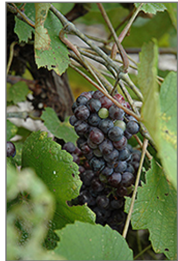
Norton Grape fruit

Aside from its primary use as an edible, Norton Grape is suitable for the following landscape applications;