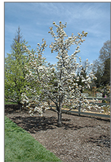
Chojuro Asian Pear in bloom