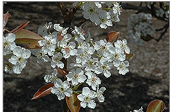
Chojuro Asian Pear flowers

This is a deciduous tree with an upright spreading habit of growth. Its average texture blends into the landscape, but can be balanced by one or two finer or coarser trees or shrubs for an effective composition. This is a high maintenance plant that will require regular care and upkeep, and is best pruned in late winter once the threat of extreme cold has passed. Gardeners should be aware of the following characteristic(s) that may warrant special consideration;