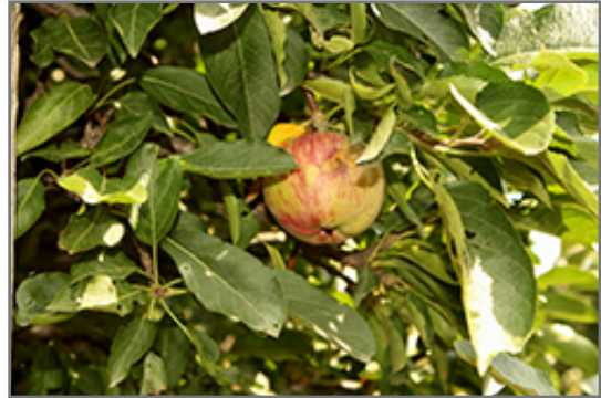
Red Chief Apple fruit

Red Chief Apple features showy clusters of lightly-scented white flowers with shell pink overtones along the branches in mid spring, which emerge from distinctive red flower buds. It has forest green deciduous foliage. The pointy leaves turn yellow in fall. The fruits are showy red apples carried in abundance in late summer. The fruit can be messy if allowed to drop on the lawn or walkways, and may require occasional clean-up.