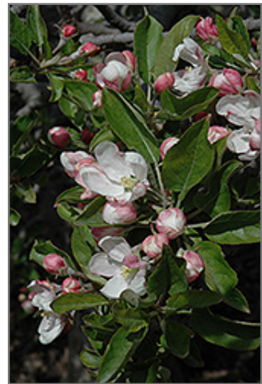
Red Chief Apple flowers