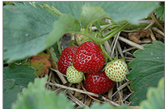
Elvira Strawberry fruit