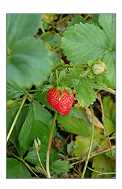
Eclair Strawberry fruit