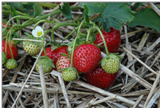
Annapolis Strawberry fruit