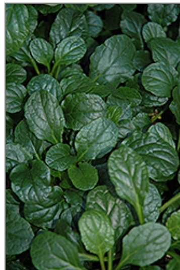
Hill Country Bugleweed foliage