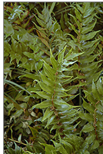
Beech Fern foliage