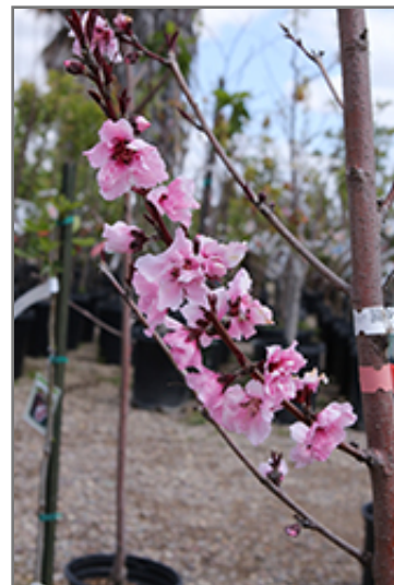
Spicezee Nectarplum flowers

Spicezee Nectarplum is draped in stunning clusters of fragrant pink flowers along the branches in early spring before the leaves. It has dark green deciduous foliage which emerges red in spring. The narrow leaves turn yellow in fall. The fruits are showy dark red drupes with shell pink overtones, which are carried in abundance in mid summer. The fruit can be messy if allowed to drop on the lawn or walkways, and may require occasional clean-up.