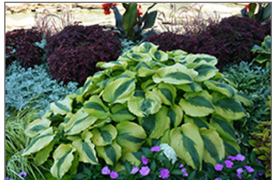
Goodness Gracious Hosta

Goodness Gracious Hosta is recommended for the following landscape applications;