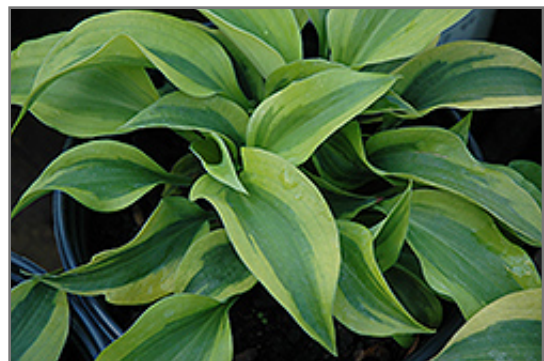
Goodness Gracious Hosta foliage