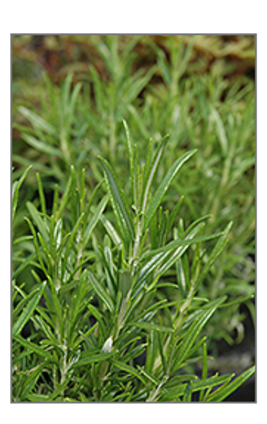
Barbeque Sky Rosemary foliage

Aside from its primary use as an edible, Barbeque Sky Rosemary is sutiable for the following landscape applications;