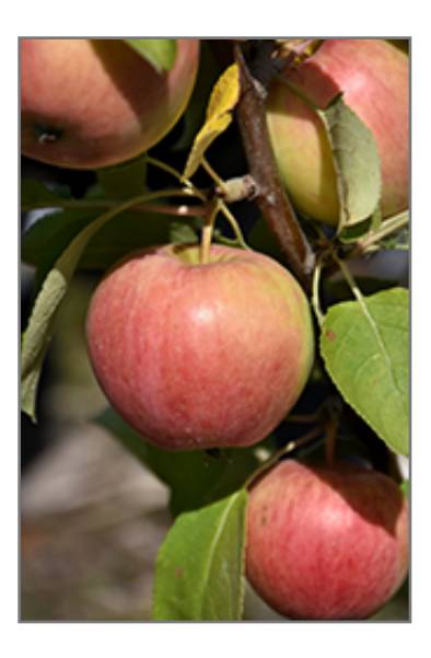
Gemini Apple fruit