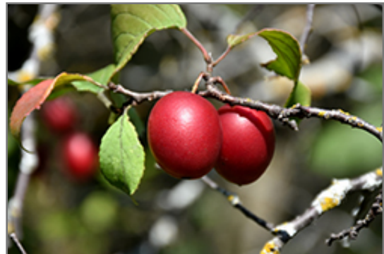
Brookred Plum fruit