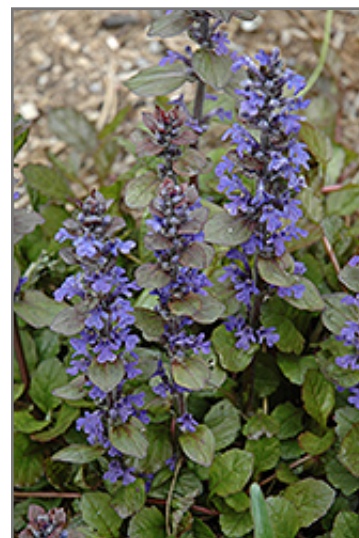
Valfredda Bugleweed flowers

A beautiful low-growing ground cover that eventually produces coppery edged foliage in shades of brown; smallish spikes of lovely blue flowers add interest in spring, makes a good filler for moist shady areas of the garden