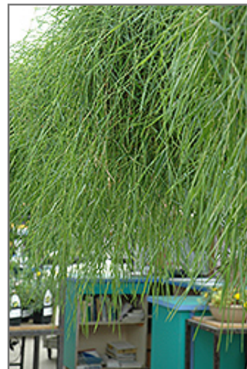
Green Twist Trailing Bamboo foliage

Green Twist Trailing Bamboo will grow to be about 14 inches tall at maturity, with a spread of 14 inches. Its foliage tends to remain dense right to the ground, not requiring facer plants in front. It grows at a fast rate, and under ideal conditions can be expected to live for approximately 10 years. As an herbaceous perennial, this plant will usually die back to the crown each winter, and will regrow from the base each spring. Be careful not to disturb the crown in late winter when it may not be readily seen!