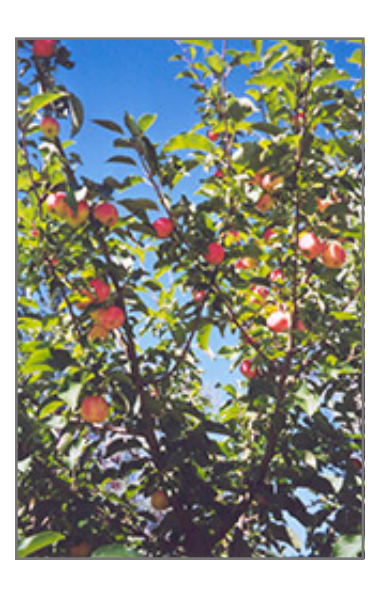
September Ruby Apple fruit